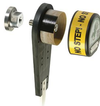
Whirligig® with Optional Mag-Con™ Connector