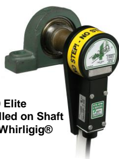
M800 Elite Installed on Shaft with Whirligig®