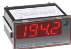
Tacho Speed Display

Whirligig®: U.S. Pat # 6,109,120 Mag-Con™: U.S. Pat # 6,964,209