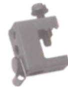
Beam Clamp, Spring Steel