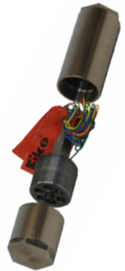
Valve Actuator Assembly - GCA P/N 02-4134