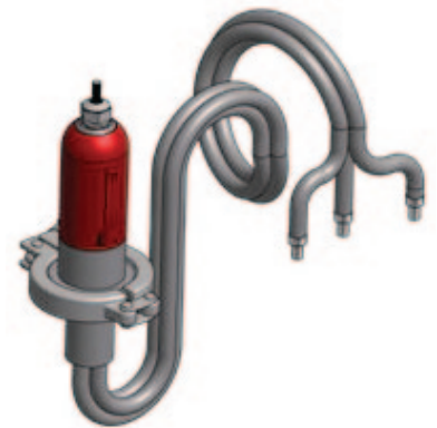
Triple Light Guide Detector sold separately