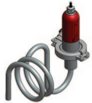
Single Light Guide Detector sold separately

The single and triple light guide kits include all mounting hardware to connect to the IREx detector. Process connectors must be ordered separately.